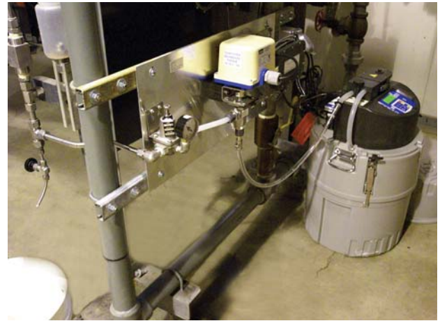
Photo shows purge line lower than desired. Optimum purging occurs when sampler outlet is higher than connection to valve.

The system components come mounted on an aluminum backing plate that also serves as a mounting bracket.